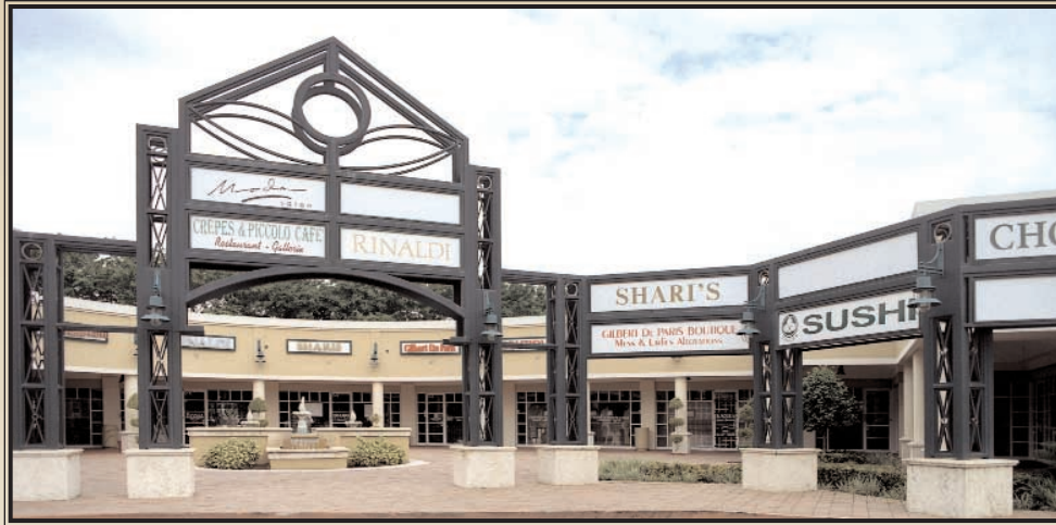
Polo Club Shoppes • 5030 Champion Boulevard • Boca Raton, Florida

Polo Club Shoppes is located at the northwest corner of Military Trail and Old Clint Moore Road in unincorporated Palm Beach County in the Boca Raton area.