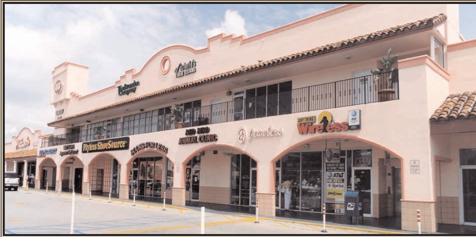
Red Bird Shopping Center • 5761 Bird Road (Bird Road and Red Road) • Miami, Florida

Red Bird is located at the northwest corner of the intersection of Bird Road (SW 40th Street) and Red Road (SW 57th Avenue) in Miami, Florida