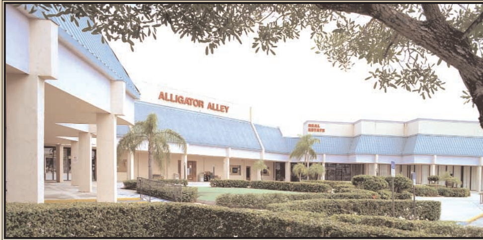
Sunset Square Shopping Center 2045 N. University Drive • Sunrise, Florida

Sunset Square Shopping Center is in the heart of Broward County at the heavily trafficked intersection of Sunset Strip and University Drive. The center enjoys easy access from both cross-streets as well as excellent visibility to the passing traffic of over 60,000 cars per day.