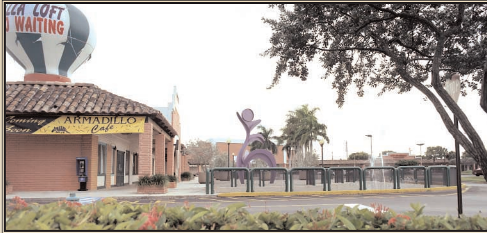
University Park Plaza • 3350 S. University Drive • Davie, Florida

University Park Plaza is situated just one-half mile south of Interstate 595 at the northeast corner of University Drive and SW 36th Street, in the Town of Davie, Florida.